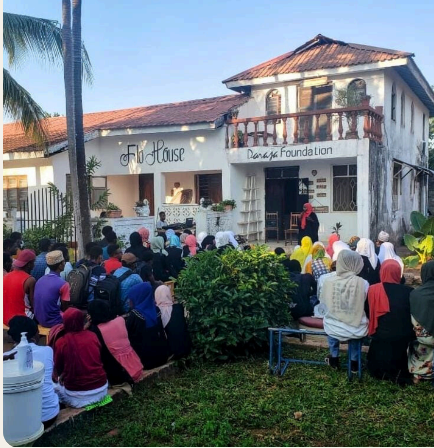
Women Leaders Speaker Series Event at Flo House

We are grateful to report that in 2023, we celebrated 10 years of Daraja Foundation. Over the last 5 years, the Flo House Transition Program has been our main focus. This year we can really see how Flo House has successfully developed into a living and meeting space for the youth of Mazizini, empowering them to reach their dreams and pursue education. We can feel how the transition house serves as a safe space for young individuals who have faced challenges and obstacles in their lives. Through mentorship, guidance, and resources, the Flo House provides a nurturing environment where these youth can thrive and grow. The house not only offers a place to stay but also fosters a sense of community and belonging, instilling values of perseverance and determination in the residents.